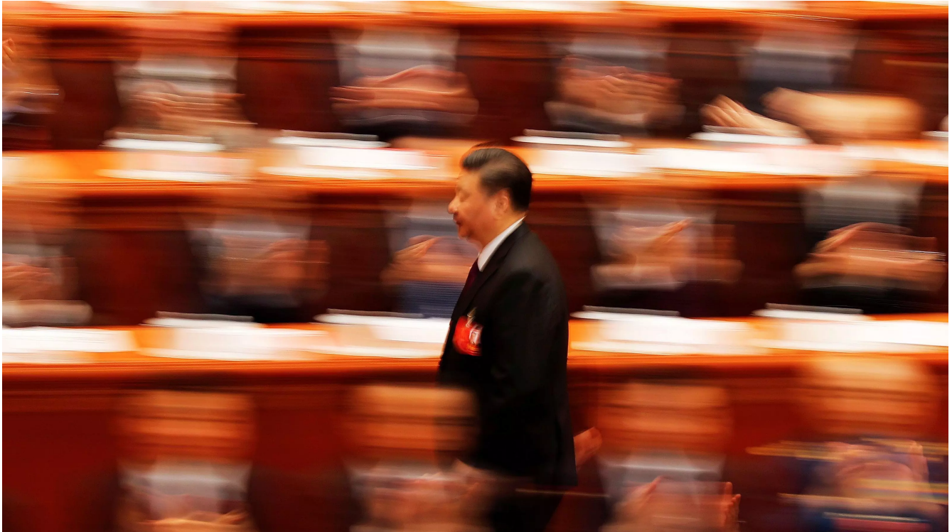
Chinese President Xi Jinping's apparent quest for more authority is driven more by necessity than a penchant for power.

Commentary in the West about Chinese President Xi Jinping's consolidation of power has focused almost exclusively on his perceived ambitions and crafty strategies as well as comparisons with Russian President Vladimir Putin, with little regard for the Communist Party's stated goals.